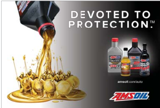
Retail Counter Mat (G3351)