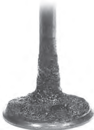
Intake Valve before P.i. Treatment