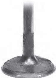
Intake Valve after P.i. Treatment