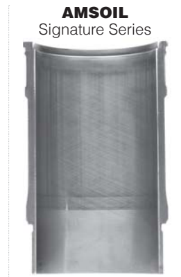
Severely Scuffed Liner Non-Scuffed Liner