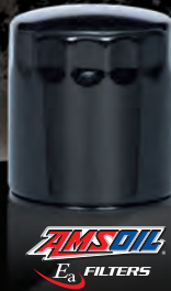
AMSOIL E3 FILTERS