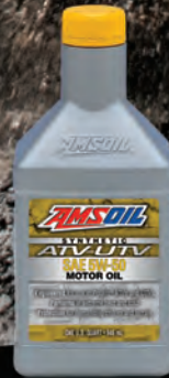
SYNTHETIC MOTOR OIL