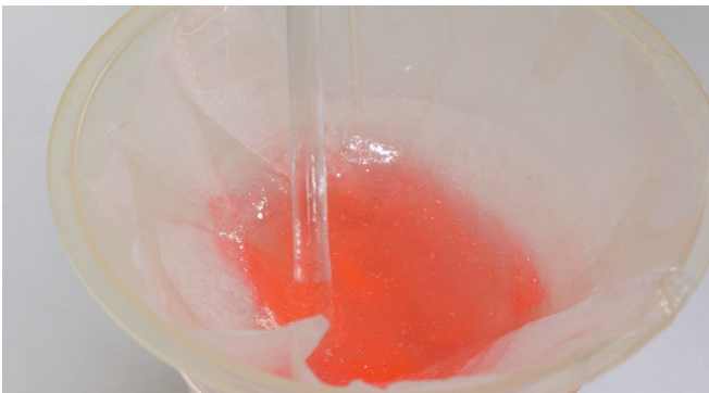
Wax formation in untreated diesel fuel plugs a coffee filter.