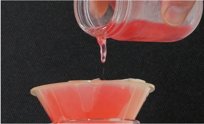
Wax formation in untreated diesel fuel resists pouring.

lowers the cold filter-plugging point (CFPP) by up to 40°F (22°C) in ULSD.