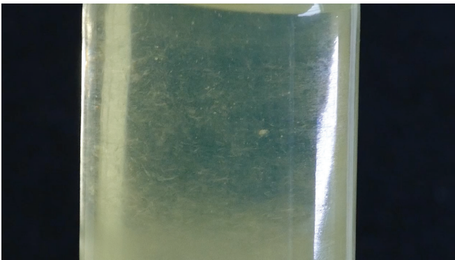
Wax crystals in untreated diesel fuel. The wax crystals will eventually fall out of solution and plug the fuel filter.